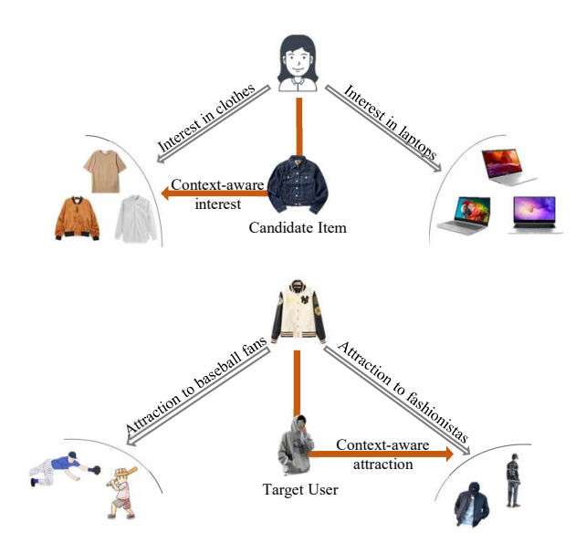
Figure 1: Illustration of context-aware user interest and item attraction. The upper part is a user's clicking history, which can be divided into two categories: clothes and computers; the lower part is a MLB varsity jacket's clicked users, which composed of baseball fans and fashionistas.

The symmetrical structure of user-item interaction data has inspired many works to design dual deep learning models to learn both user and item representations, respectively [5, 7, 9, 18, 35]. The dual models of user and item have symmetrical structures with identical or similar deep learning operations. For example, DANSER [35] develops a dual-graph attention network to model the two-fold social effects for social recommendation. DICER [7] extracts deep context-aware features of users and items with dual side modulation. However, although the user and item have symmetrical interaction data structure, their data have different semantic features for recommendation. For example, let us consider a user who has clicked several laptops, mice and keyboards. Apparently, these clicked items have substitutive relations (e.g. laptop-laptop) and complementary relations (e.g. computer-mouse-keyboard), i.e., there are strong interdependencies among the user's clicked items. However, the historical clicking users of a certain item usually do not have such explicit interdependencies among them. Thus learning representations of users and items from historical interaction data with symmetrical dual models may not be sufficient and reasonable to extract their unique semantic features.